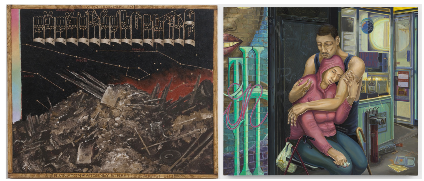
Martin Wong, Everything Must Go, 1983, acrylic on canvas, 48 x 60 inches